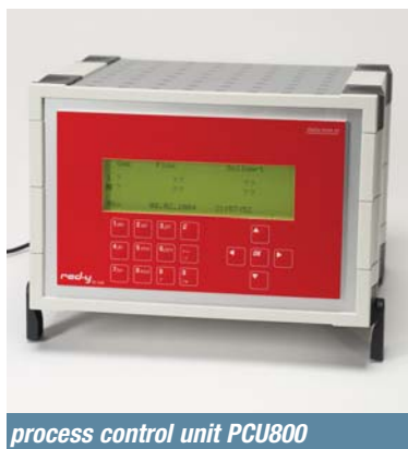
process control unit PCU800

System expandable with analog and digital inputs and outputs